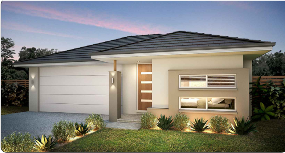
This illustration is artists impression only